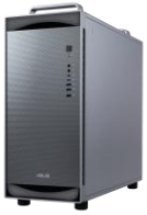
ASUS ExpertCenter Pro ET900N G3